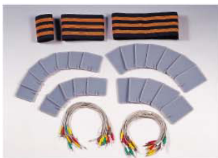
Medium frequency acc