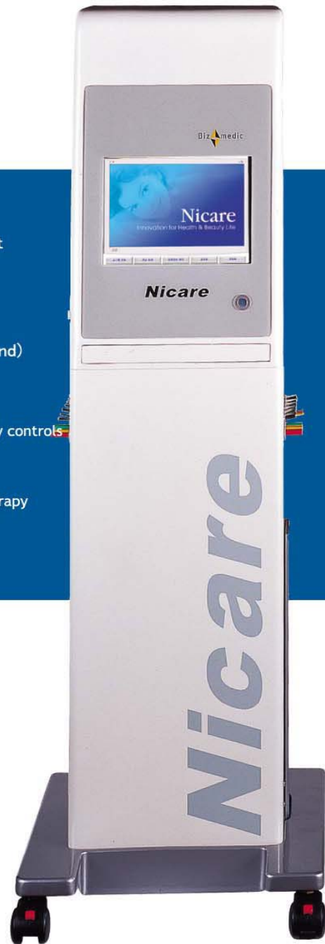
Combination Obesity Treatment Equipment